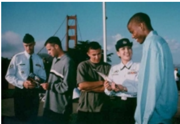
Recruiters provide information about the Air Force to the public and play a key role in gaining and maintaining public support.

Recruiting services have a significant impact on public affairs operations. Specifically, they play a large role in gaining and maintaining public support for aerospace operations. Recruiters represent the Air Force in local communities and may be the only personal interface between the Air Force and the public. They are the first step in the process of providing highly qualified men and women who ultimately enable commanders to execute military operations.